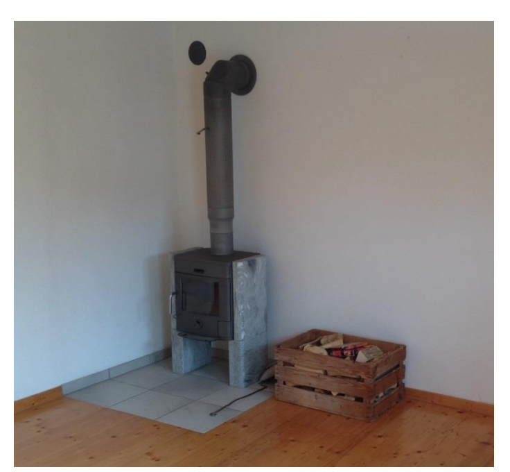
Small Wood-Burner in Downstairs Apartment

Use the small logs in the top-end section in the driveway.